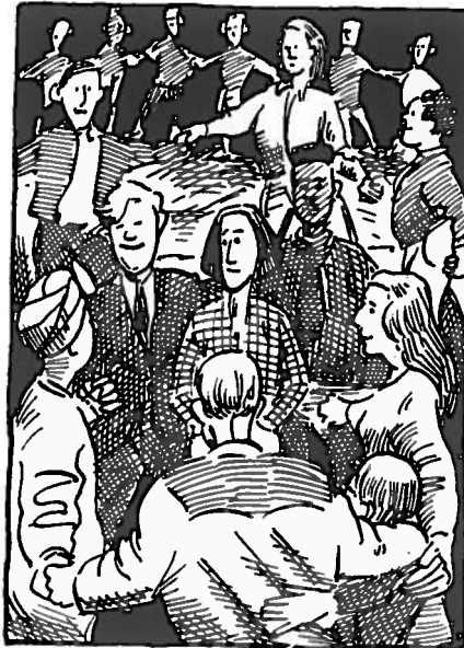
A series of concentric circles around the individual

This is why ultimately no task is more important in the new democracies than the building of civil societies. We can all contribute by helping sustain publishers and research institutes, foundations and voluntary organizations, public-interest groups, small businesses and a panoply of non-governmental agencies.